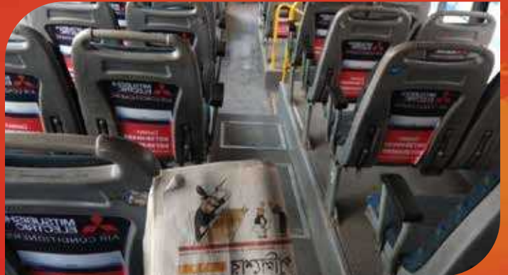
Volvo Bus Branding, Kolkata & Guwahati