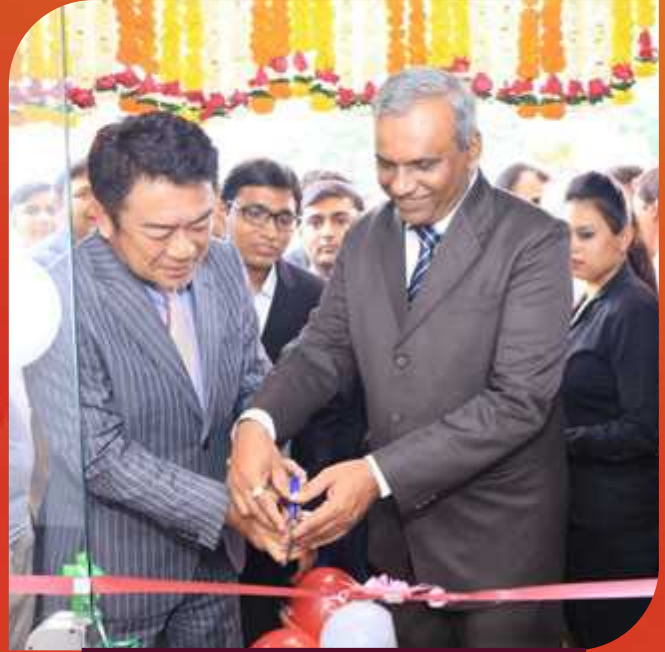
Jay Khodiyar Refrigeration, Surat