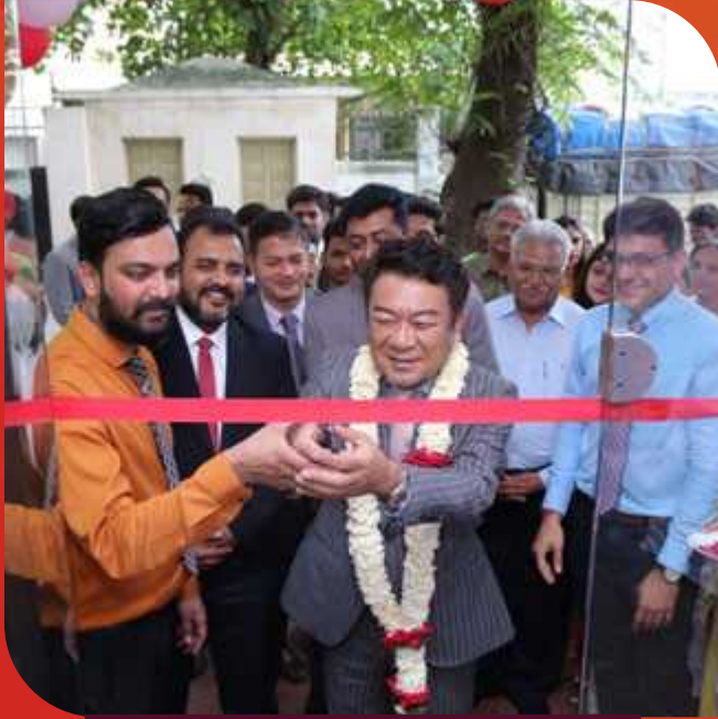
TRT Technologies LLP, Surat