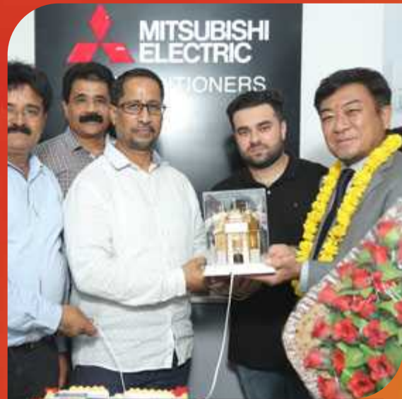
Crew Services, Amritsar