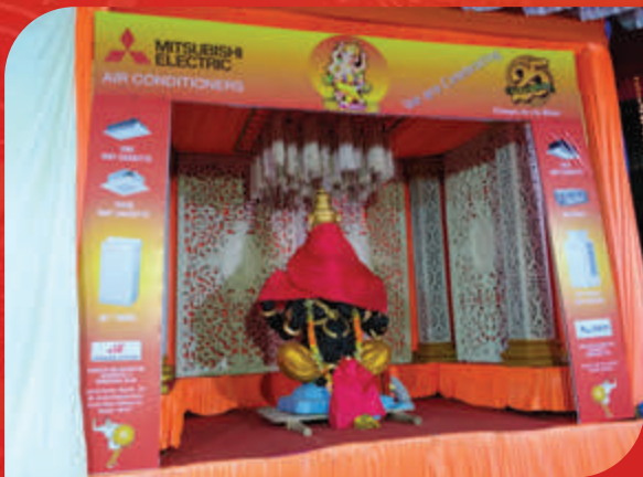
Arch Gate, Mumbai