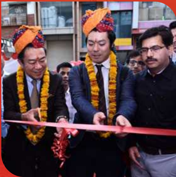
Vatanukulan Engg., Jaipur

MEQ Hiroba is a Japanese term which means a public space for people to gather. MEQ Hiroba is the platform where new technologies are announced and offers the range of Mitsubishi Electric products with highly advanced technology, quality and durability at a sustainable cost. Mitsubishi Electric Quality (MEQ), measures the quality to give the best experience in our products, services, partnership and people.