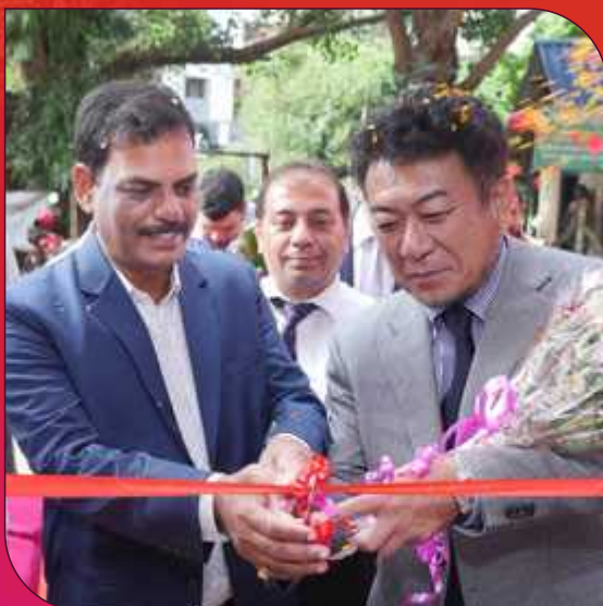
Cool Care Refrigeration, Bhubaneswar