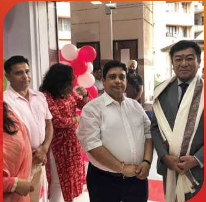
Aggarwal Agencies, Jammu