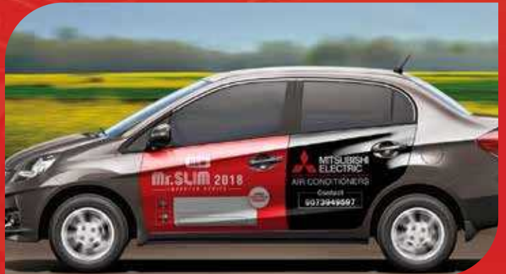
CAB Branding, Kolkata & Bhubaneswar