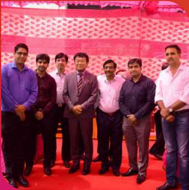
Humid Air, Delhi