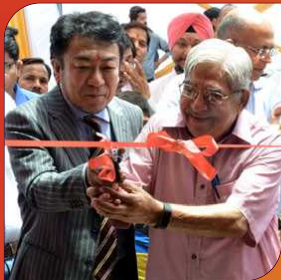
Vigasa Industries, Gurgaon