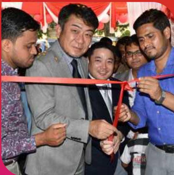
S.R. Refrigeration, Cuttack