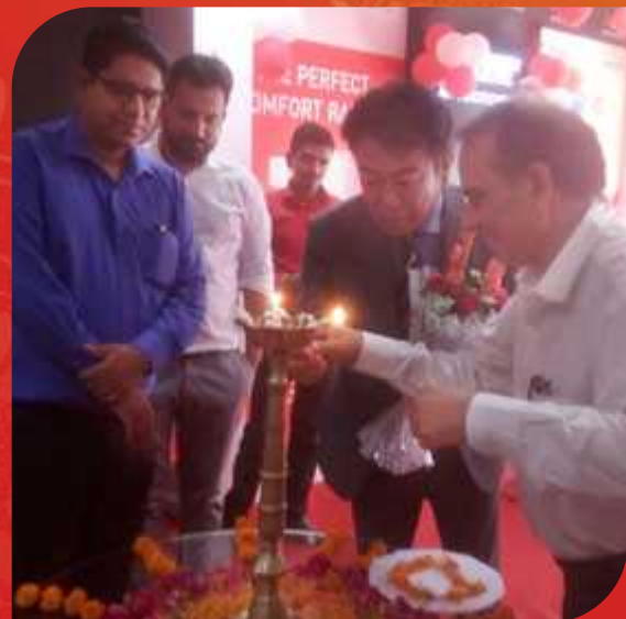
Pahuja Aircon, Gurgaon