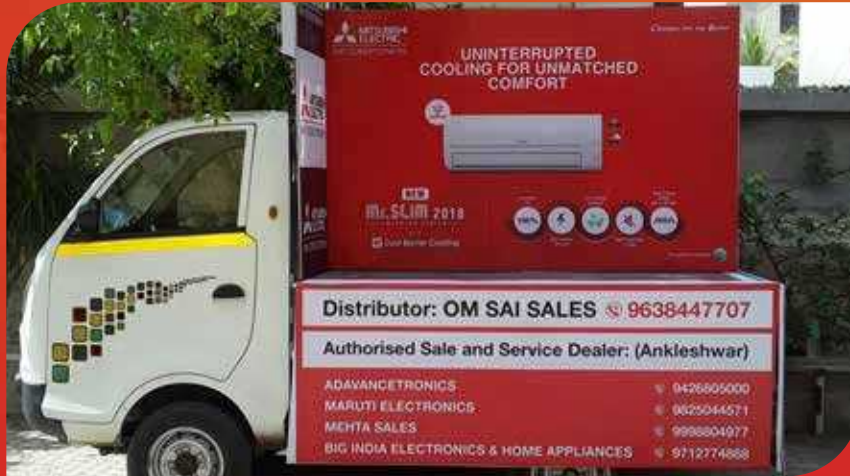
Hoarding on Wheels Campaign, Surat