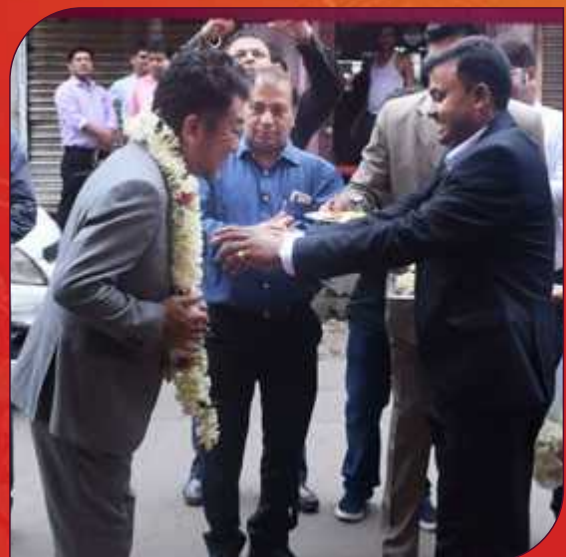
Essgee Enterprises, Kolkata