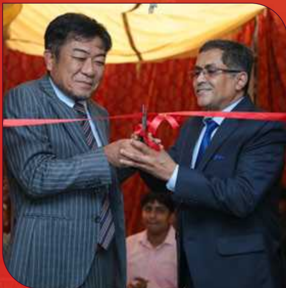
Iceberg Enterprises, Gurgaon

MEQ Cooling Planet is a unique concept showroom that clubs together Mitsubishi Electric's world-class technology and affordability. MEQ Cooling Planet offers a range of the company's products with quality and durability. These showrooms are designed to encourage residential and commercial customers to have a touch and feel of MEI products.